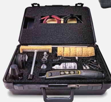
Complete Kit shown