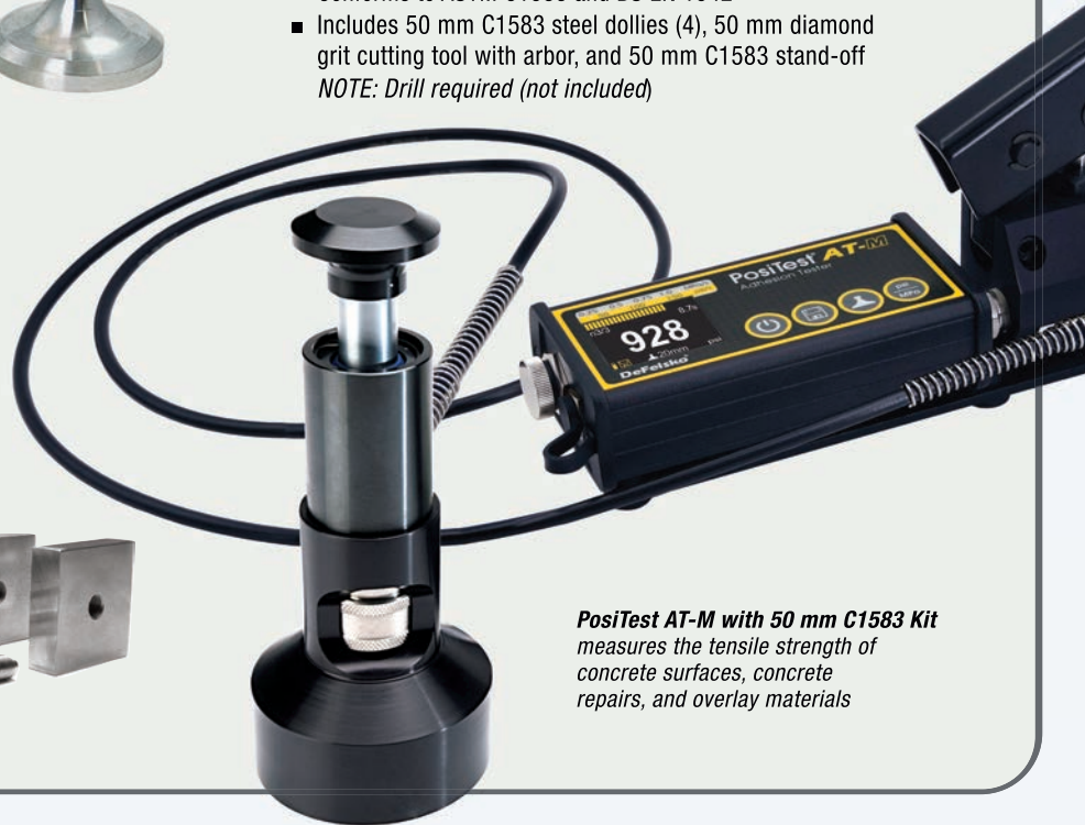
PosiTest AT-M with 50 mm C1583 Kit measures the tensile strength of concrete surfaces, concrete repairs, and overlay materials