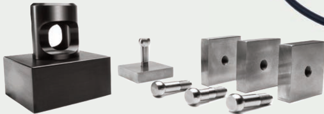
PosiTest AT 50T KIT measures the tensile strength of ceramic tile adhesives.